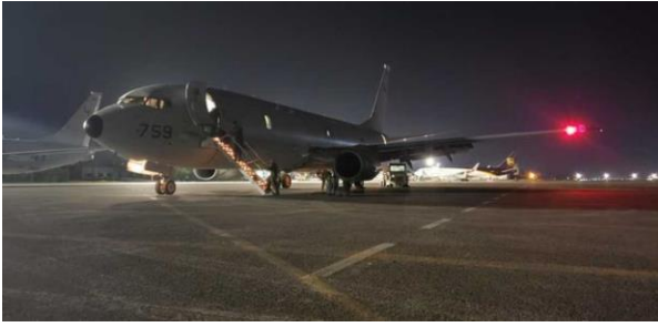
Sailors assigned to VP-16 prepare a P-8A aircraft for a flight.