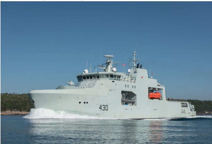
HMCS Harry DeWolf.

On August 1, 2020, the Royal Canadian Navy (RCN) marked the most significant milestone in its shipbuilding programme with the delivery of the first new Arctic and Offshore Patrol Ship (AOPS) to Halifax, NS, Her Majesty’s Canadian Ship (HMCS) Harry DeWolf. It is the first ship built for the RCN under the National Shipbuilding Strategy. “The delivery of HMCS Harry DeWolf, first of a class of six Arctic and Offshore Patrol Ships (AOPS), marks the beginning of an exciting time for the RCN – our future fleet is beginning to be delivered. These ships will be at the core of an enhanced Canadian Arctic presence, effectively complementing the capabilities of our other current and future warships through critical reconnaissance and surveillance operations. “The Harry DeWolf-class will also