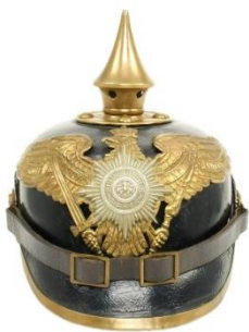
The German pickelhaube was generally made of leather.

The results suggest there is. The blast tests found that, bareheaded, the risk for mild, moderate and severe bleeding of the tissue surrounding the brain was in the 50 per cent range. All helmets subjected to the same blast conditions showed less than 10 per cent risk of moderate bleeding at the crown, with the Adrian helmet coming in at close to one per cent. “Helmets provided more shock wave attenuation at lower pressure levels than at higher pressure levels,” the scientists observed, “suggesting that helmets might play an especially important role in protection against mild primary blast induced brain trauma. “The effect of wearing a helmet, especially for short positive phase durations (0.5–5 milliseconds), is a significant reduction in risk of blast brain injury at the crown of the head for overhead blast scenarios.” The results varied for other parts of the head and ears, depending on the shape of the helmets.