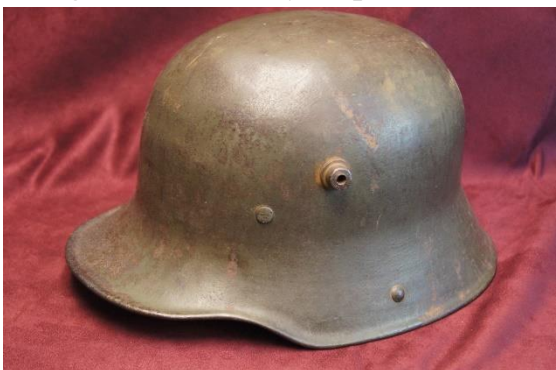
The German 1916 Stahlhelm helmet was designed after existing Allied versions were assessed.

In what is believed to be the first study of its kind, the helmets were mounted on sensor-equipped dummy heads and aligned with a cylindrical shock tube to simulate an overhead blast. A bare-headed test was also conducted. The team then generated primary blast waves of different magnitudes based on estimated blasts from historical shells. Peak reflected overpressure at the open end of the blast tube was compared to measurements at several head locations. “All helmets provided significant pressure attenuation compared to the no-helmet case,” said their paper, published Feb 13 in the online journal Plos One . “The modern variant did not provide more pressure attenuation than the historical helmets, and some historical helmets performed better at certain measurement locations. “The study demonstrates that both historical and current helmets have some primary blast protective capabilities, and that simple design features may improve these capabilities for future helmet systems.”