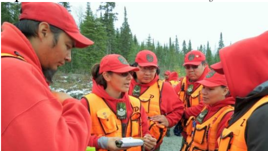
The Canadian Rangers usually perform search and rescue operations and respond to natural disasters.