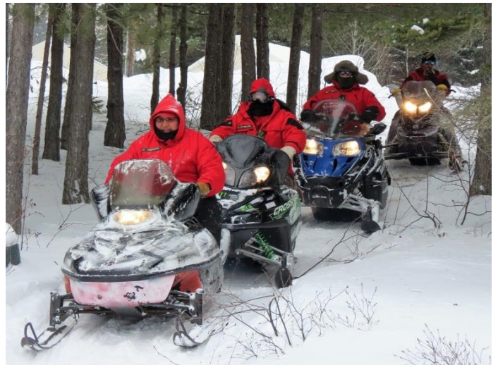
So-called "go teams" of six to eight Canadian Rangers are ready to react and deploy immediately to communities without their presence.