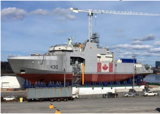
HMCS Harry Dewolf, lead vessel in class, under construction in the Halifax Shipyard May 2018