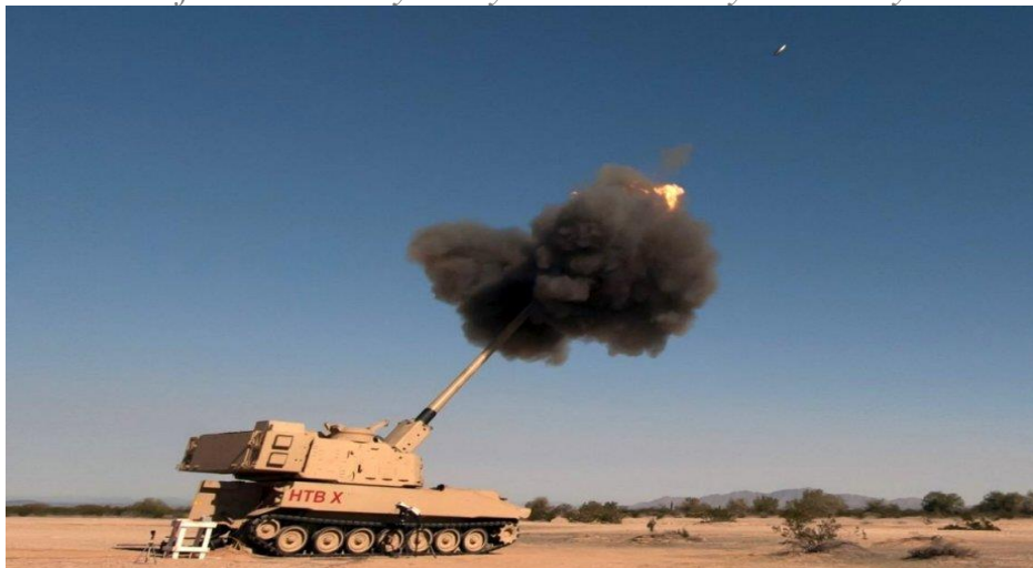
XM1299 self-propelled howitzer firing test

Global Defense Security army news industry 22 July 2019