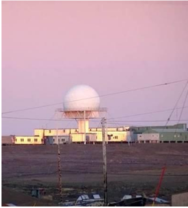
This radome holds radar equipment for the Cam Main North Warning System station in Cambridge Bay.