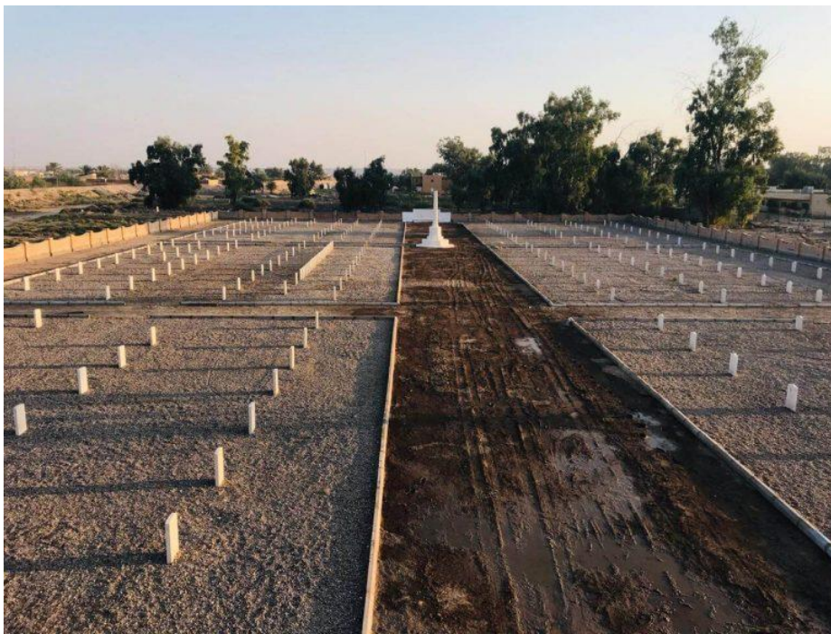
The war graves commission has installed 300 new headstones at Habbaniya War Cemetery in Iraq.

the First World War, when it was still Mesopotamia, Iraq was the scene of the British Empire's largest operations outside of Europe. It suffered its worst defeat in the Siege of Kut. The commission's work within Iraq's borders has stopped and started numerous times since it formally withdrew from the country in 1990. Sites have deteriorated as the salty soil has seeped into headstones, making them so brittle they crumble. Iraq's largest memorial, the Basra Memorial, was moved into the desert in the late-1990s from its original site on the banks of the Shatt al-Arab River. Now, after decades without regular maintenance, the memorial is showing signs of age and neglect. The commission site says the memorial is missing 30,000 names. "When [it was] first unveiled in 1929, the names of most of the men of the Indian Army who it commemorates were not accurate," says the commission. "Records at the time hadn't been properly compiled and the commission could only be provided with the names of Indian officers, and British officers and men. "Since then, an accurate list of the names has been compiled and all lie in the CWGC's Iraq Roll of Honour, on display in the UK, waiting for a time when conditions on the ground allow a more permanent solution."