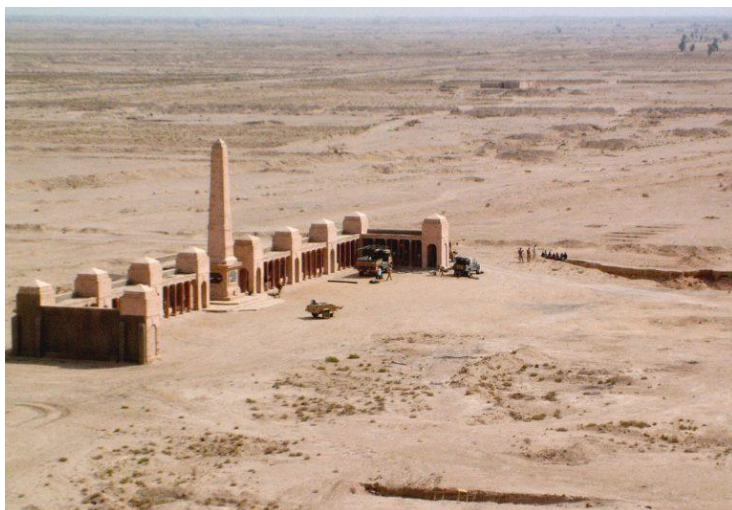
The Basra Memorial in Iraq commemorates 40,682 Commonwealth forces—99 per cent of them from India—who died in the Mesopotamian Campaign of the First World War.

The commission administers 19 sites in Iraq, and most have deteriorated or been damaged due to more recent wars. During