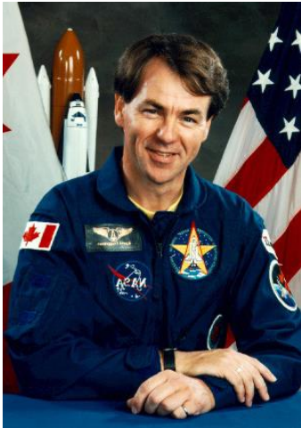
Bjarni Valdimar Tryggvason, one of Canada's first astronauts, will be inducted into Canada's Aviation Hall of Fame in 2020.